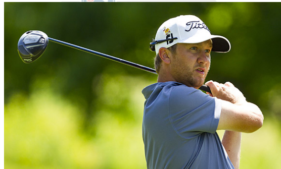
Brice Garnett - PGA Tour